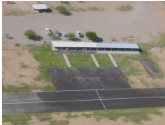
TIMPA Field on Reservation Road

Access cards will be available to any AMA member